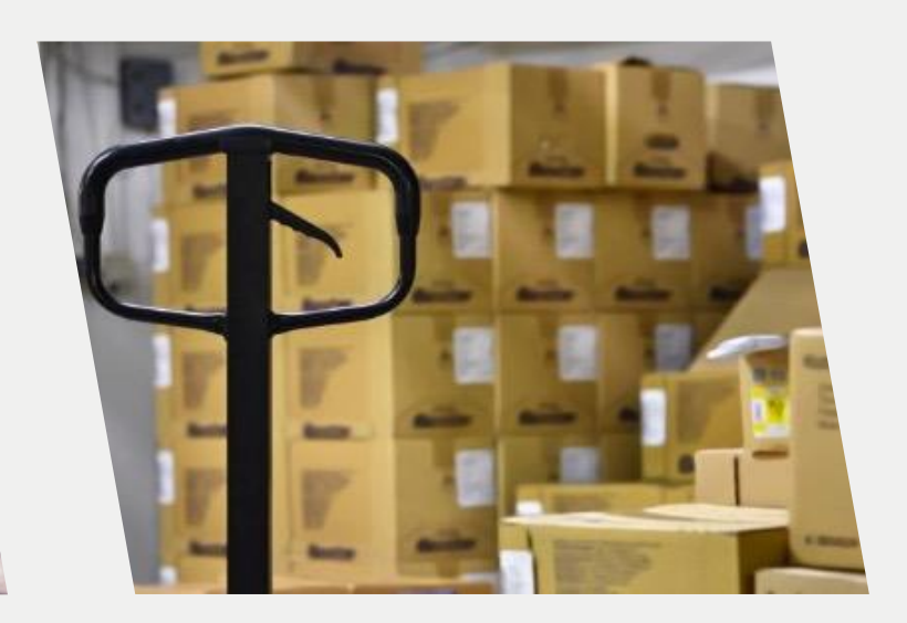
TRANSPORT & LOGISTICS